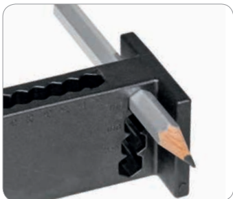
Door marking aid accessory available

Protect little fingers from getting crushed in closing swing doors